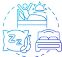
GET PLENTY OF SLEEP